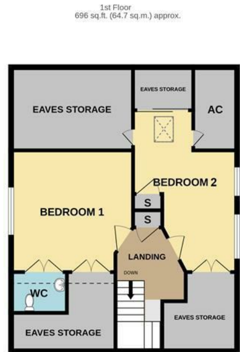
1st Floor 696 sq.ft. (64.7 sq.m.) approx.