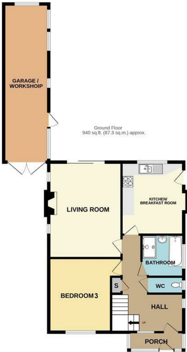
Ground Floor 940 sq.ft. (87.3 sq.m.) approx.